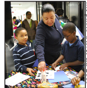
file photo Oliver ES 2009